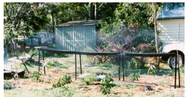
Figure 8: The final product- a simple, low maintenance, cost effective nursery system capable of producing medium level seedling numbers.