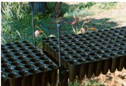
Figure 7: Micro sprinklers attached to the support posts as part of the automated irrigation system.

simple irrigation system using micro sprinklers (Fig 7) is all that is needed to ensure the entire nursery is supplied with an even application of water.