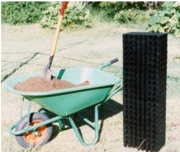
Figure 1: A stack of 40 cell seedling trays and a wheelbarrow load of potting mix.

The potting mix illustrated consists of 1 : 1 peat moss : river sand with 25g of NPK fertiliser added to every 10L of mix. The pot design illustrated (Fig 2) allows for efficient handling and storage of seedlings, and will produce a seedling that is vigorous on planting. Pots of this style are available in a range of sizes. All pots should possess root-training ridges. These ridges, running down the inside of the pot., reduce the incidence of root binding.