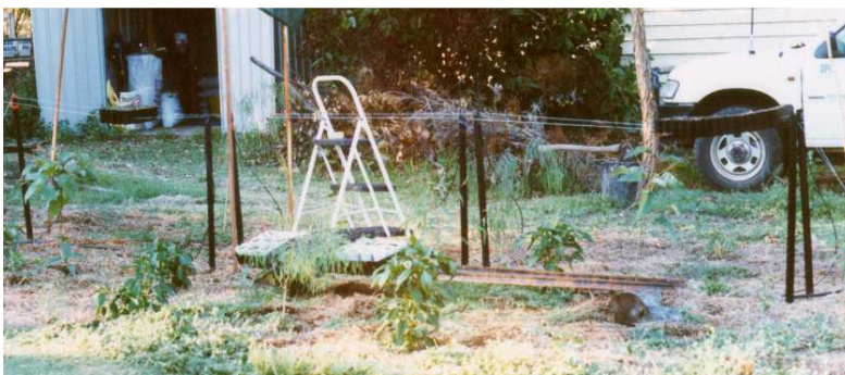
Figure 4: A simple design for a seedling bench- two parallel rows of posts supporting high tensile wire. This is a cost effective design that allows ease of management and promotes healthy seedling development.