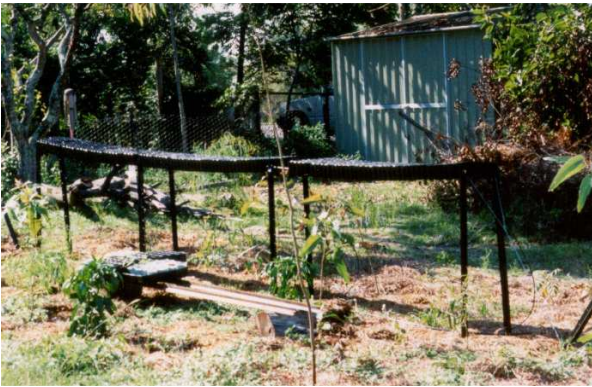
Figure 5: The potting media filled seedling trays supported on the wire bench.

Step 4. Place the media filled pots onto the wire bench(Fig 5). The wires will slide up between the first and the second rows of cells at either end of the seedling trays. This will hold the trays firmly in place while still allowing easy relocation should the need arise.