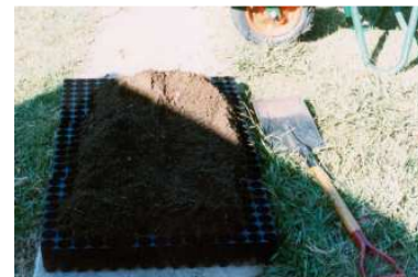
Figure 3: Filling the seedling trays on a solid surface.

Step 3. Construct a bench that will elevate the pots off the ground. Ideally the bench will be of such a height that allow ease of access to, and maintenance of, the seedling. The bench also needs to provide open ventilation for the seedling roots. This will ensure a healthy and vigorous root system by promoting air pruning of any roots that protrude from the bottom of the pot. The bench show in Figure 4 is constructed from two parallel lines of steel posts. Along the top of these posts has been strung parallel high tensile wires. The wires are spaced at a distance from each other that allows them to be