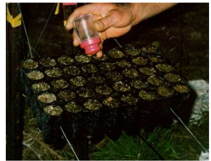
Figure 6: Direct seeding eucalypt seeds into each cell using a salt shaker.

Step 6. One of the most time consuming aspects of growing seedlings is the regular watering they require. Most failures in the propagation process arise from this issue. Water timers capable of automating this entire process can be obtained quite cheaply from a number of good hardware retailers. These can be programmed to turn the watering system on and off several times per day over a weekly cycle. As a general rule, actively growing seedling require watering once to three times per day, seven days per week. A